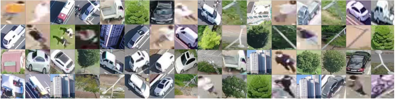
Fig. 4. Example Image of Drone Image Dataset.