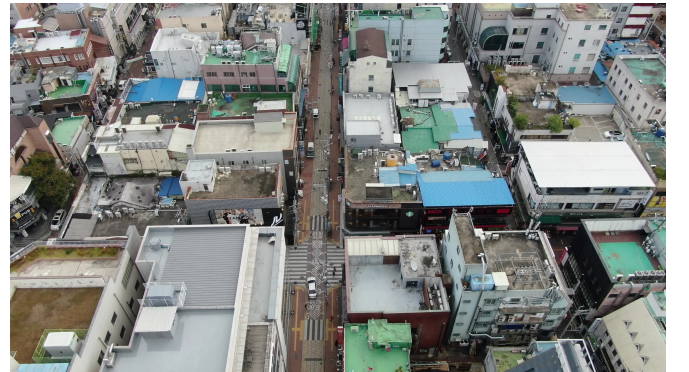
Fig. 3. Original drone image before cropping image.

The network in this paper is easy to understand as shown in Fig.1. The configured network is structured very sequentially. Simply, CB and SB are connected in sequentially.