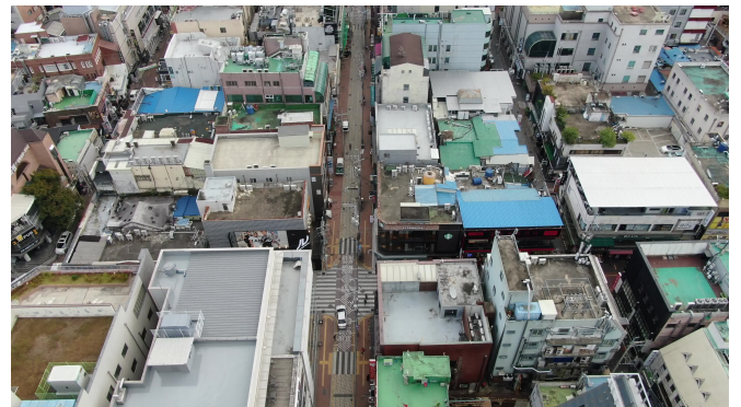
Fig. 3. Original drone image before cropping image..

The network in this paper is easy to understand as shown in Fig.1. The configured network is structured very sequentially. Simply, CB and SB are connected in sequentially.