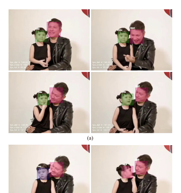
Fig. 3. The correct prediction result (a) and the incorrect prediction results (b) of the Age-CPU detector.

The proposed attention module with various reduction ratios r is also compared with other lightweight attention methods such as Squeeze-and-Excitation (SE) [25] and Convolutional