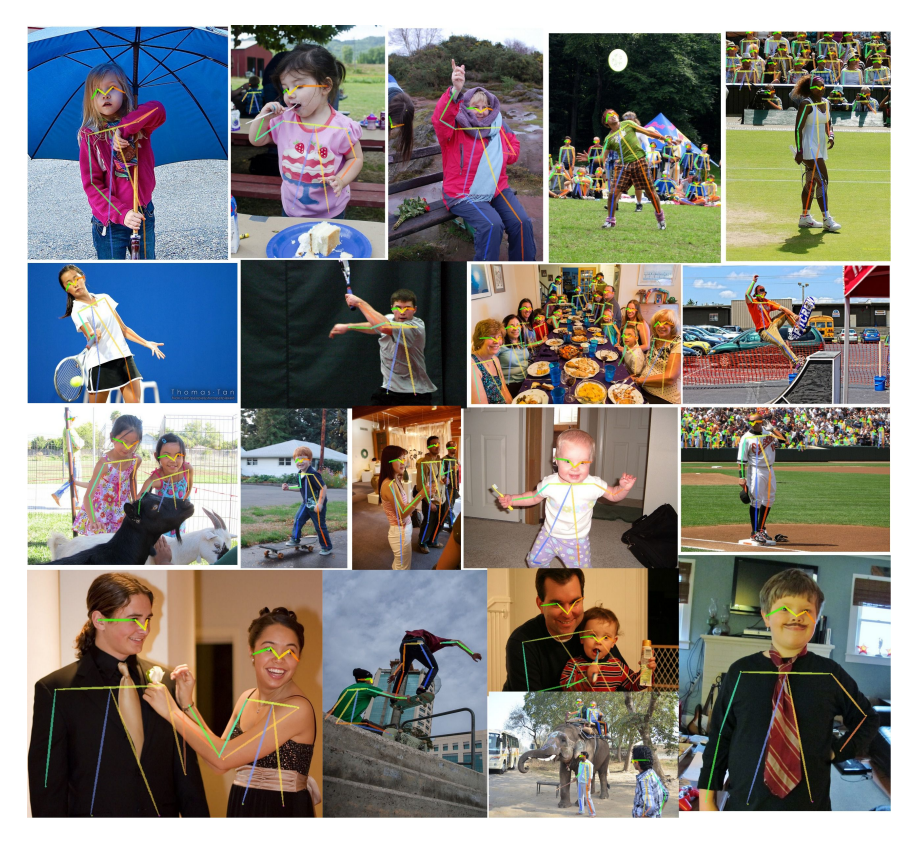
Fig. 4. Qualitative result for human pose estimation in COCO2017 test-dev set